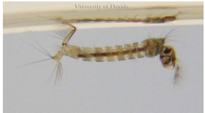
Figure 3. Larva of Culex (Melanoconion) pilosus , a mosquito.

The larvae of Cx. pilosus have a broad head and long antennae with a large tuft at the ends. On the ventral side of the larval head, an oval gill is inserted at the base of the antennae (Carpenter and LaCasse 1955). They have an upcurved siphon and a curved preapical spine at the end of the siphon. There are eight pairs of long tufts of setae on the siphon, comb scales on the eighth abdominal segment in a single row that appear long and pointed, and gills of two different lengths (Cutwa and O'Meara 2012).