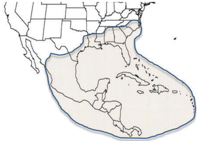
Figure 2. Distribution of Culex pilosus as of March 2012.