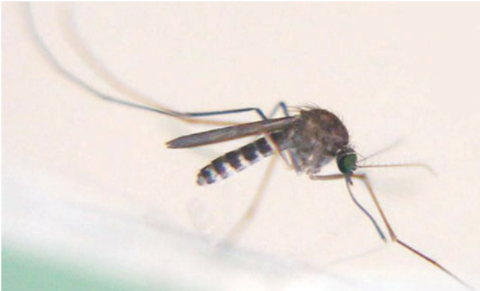
Figure 1. Adult female Culex (Melanoconion) pilosus , a mosquito.

Culex (Melanoconion) pilosus (Dyar and Knab 1906) is a small, dark mosquito that tends to feed on reptiles and amphibians. It is found in the southeastern United States and in many countries in Central America and South America. It has not been identified as a species of medical importance as it has not been shown to vector pathogens like some other Culex species.